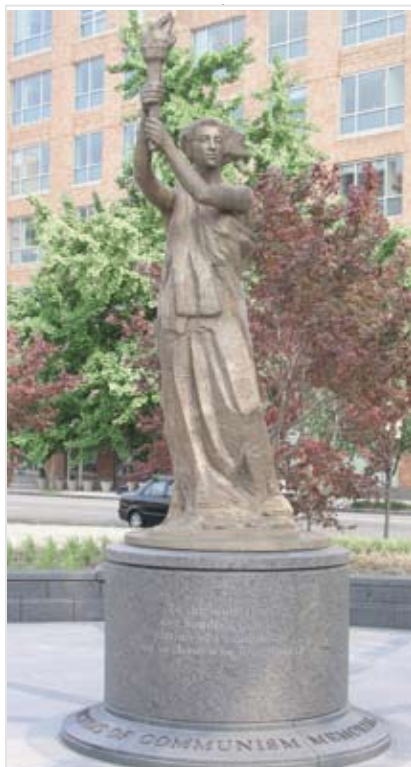
The Memorial to the Victims of Communism was modeled after the papier-mache Goddess of Democracy Chinese students erected in Tiananmen Square in 1989

The memorial features a bronze statue modeled on the papier-mache “Goddess of Democracy” fabricated in 1989 by Chinese students who were protesting communist oppression in Tiananmen Square. The inscriptions on the memorial were conceived by scholar Lee Edwards and former Ambassador Lev Dobriansky. They read: “To the more than 100 million victims of Communism and to those who love liberty” and “To the freedom and independence of all captive nations and peoples”. ▶