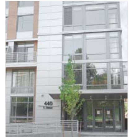
The L is almost ready to open on the north side of the Triangle.

dential buildings to open will be The V, with 244 rental apartments, followed by The K condominiums with 292 units. ▶