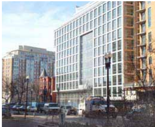
455 Mass completes the Massachusetts Avenue street wall with distinction.

The first new Class-A office building to be developed in Mount Vernon Triangle in more than 25 years, 455 Massachusetts Avenue, NW officially delivered on February 15, 2008. The 12-story building contains 250,000 square feet of rentable office space, four levels of below-grade parking, 14,000-