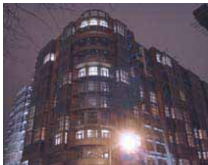
Madrigal Lofts' distinctive lighting adds sparkle to the East End.

Located half a block from Massachusetts Avenue, the 12-story, loft-