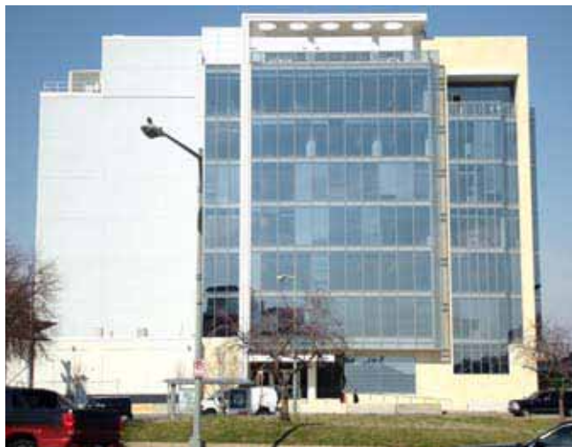
AIPAC's daring modern design is right at home in today's stylish Mount Vernon Triangle.

After more than fifty years in Washington, the American Israel Public Affairs Committee (AIPAC) has established a