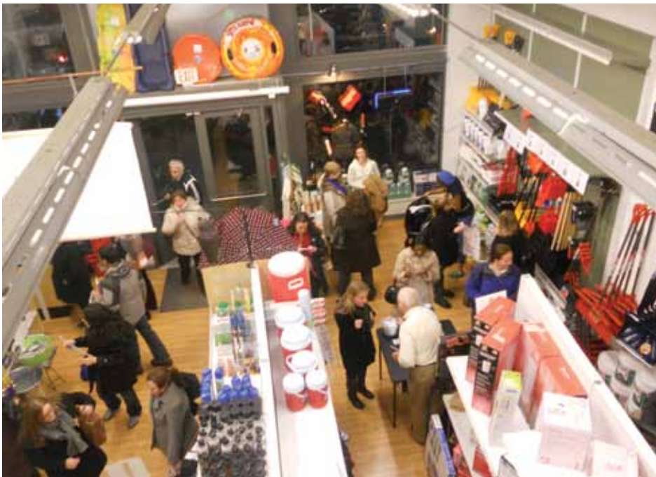
5th Street Ace Celebrates Women Do-It-Yourselfers by Hosting 200 Women at their Ladies Night Event in February.