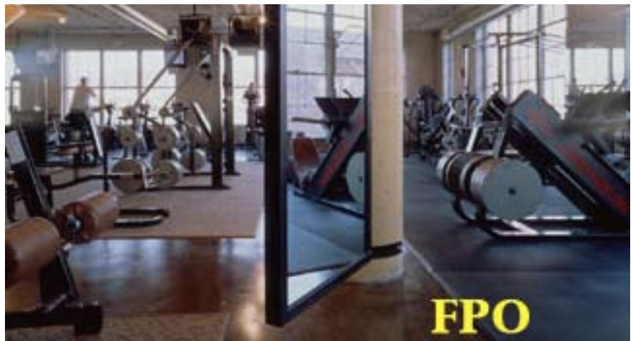
Results. the Gym

Continuing their model of providing state-of-the-art fitness equipment and programming, this Results is scheduled to open in the summer of 2008. It will include three studios for yoga and Pilates, dry and steam saunas, wireless internet access, a state-of-the-art sound system, and the "Good to Go" cafe. Free weights, circuit-training equipment, treadmills, ergometers, elliptical and Precor