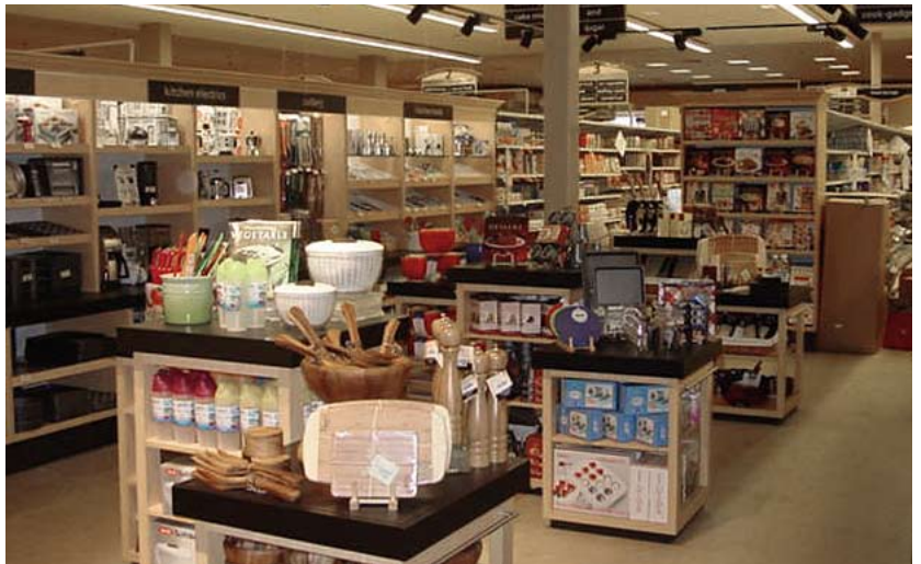
“Lifestyle” Safeway will provide an upscale shopping experience for Triangle residents

ing the Northern Liberties Market, Dupont Circle, and Chinatown. The