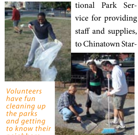
Volunteers have fun cleaning up the parks and getting to know their neighbors

On Saturday, October 13, ten neighborhood volunteers came together to help the National Park Service clean up the parks at 5th and Massachusetts Avenue, NW, known as Reservations 72 and 74. Volunteers rolled up their sleeves to pick up trash and then paint the wrought-iron fence, benches and trashcans. Thanks are due to the Na-