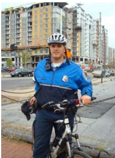
MVTCID is now hiring MPD Officers on Thursday, Friday, and Saturday nights to help maintain safety