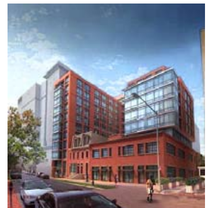
The Eye Street Lofts will incorporate three historic buildings

The project will now move into the design phase. Walnut Street