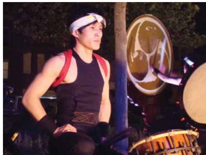
Kushi brought students from Tamagawa University to perform in front of their restaurant during last year's Cherry Blossom Festival

If you have any interest in participating, please contact Remi Allen at remi@downtowndc.org or (202) 638-8372.