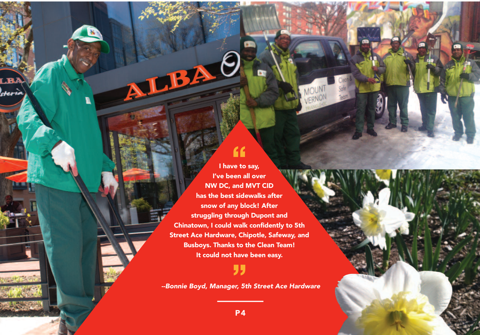
MVT Clean Team Ambassadors

The MVT CID's Ambassadors come to us from the Central Union Mission Ready to Work job training program. The program supports formerly homeless men and women and provides customer service and business skills training, financial literacy, technology skills and other opportunities. Working as part of the Clean Team is transformational for our crew members, often leading to independent living outside of the Mission and the ability to establish credit, all while learning in a rewarding and stable work environment. We would like to extend a special thank you to the District's Department of Small and Local Business Development for the BID Litter Cleanup Grant of $100,000 that helps supplement funding of the Clean Team and allows the MVT CID to hire additional District residents as MVT Ambassadors.