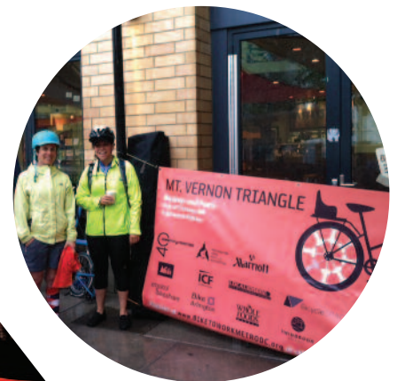
Bike to Work Day