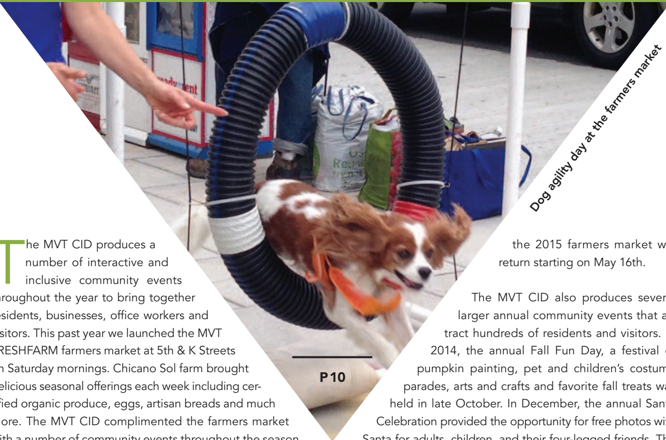
Dog agility day at the farmers market

The MVT CID produces a number of interactive and inclusive community events throughout the year to bring together residents, businesses, office workers and visitors. This past year we launched the MVT FRESHFARM farmers market at 5th & K Streets on Saturday mornings. Chicano Sol farm brought delicious seasonal offerings each week including certified organic produce, eggs, artisan breads and much more. The MVT CID complimented the farmers market with a number of community events throughout the season, including a dog agility day, the Color the K art event, children's activities and story times, chef demos, complimentary lemonade and an MVT CID information table with sponsored market shopping bags. The MVT CID initiated the market in response to the 2013 Perception Survey results, which showed overwhelming demand for a farmers market in the neighborhood. Local market operator, FRESHFARM, was very pleased with the support from the Triangle and our adjoining communities and