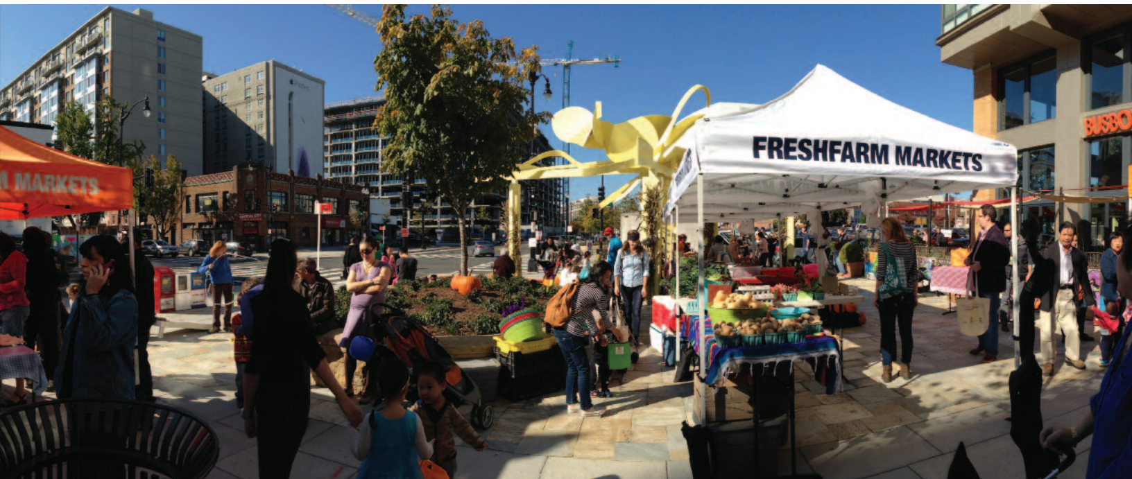
Saturday morning at the MVT FRESHFARM farmers market

The MVT CID also produces several larger annual community events that attract hundreds of residents and visitors. In 2014, the annual Fall Fun Day, a festival of pumpkin painting, pet and children's costume parades, arts and crafts and favorite fall treats was held in late October. In December, the annual Santa Celebration provided the opportunity for free photos with Santa for adults, children, and their four-legged friends. The MVT CID also gives a number of neighborhood walking tours throughout the year, helping to familiarize tenants, residents and visitors with our rich history and exciting future. We partner with BicycleSPACE on hosting a Bike to Work Day pit stop in mid-May and support local events such as the 5th Street Ace Hardware Ladies Night, Alba Osteria's Dog-Friendly Happy Hours, weekly food and wine tastings at Eye Street Cellars, the AAMC holiday toy donations, new building and business openings and more.